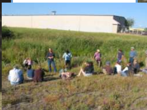
(Community members touring restoration projects on Amazon Creek)

The Long Tom Watershed Council (LTWC) is a local non-profit with a diverse board that includes members from the business, farm, forest, conservation, and science communities. We believe that learning and action are the keys to river and community health.