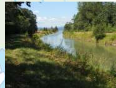
Amazon Creek entering Fern Ridge Reservoir

Assisting community members in implementing pollution prevention projects and retrofits to existing developments will also help in reducing polluted runoff from entering the creek.