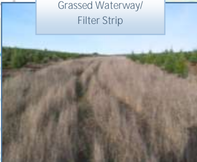
Agricultural Best Management Practices such as grassed waterways and filter strips reduce runoff from entering local creeks