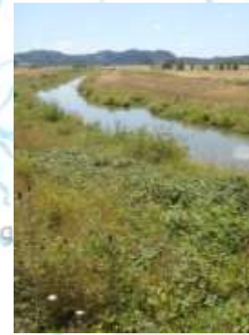
Amazon Creek in the West Eugene Wetlands

Through a Pesticide Stewardship Partnership (PSP), the LTWC and our partners will take steps to improve water quality by working with the community to reduce pesticide levels in the creek.