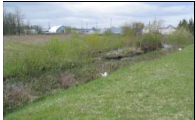
Top : Pre-project (2001) looking south across Amazon Creek at the section to be restored. Middle : Excavators removed thousands of yards of soil in order to slope the banks back and create winter high flow channels. Also, the bike path was moved farther from the creek to make room for the new floodplain. Bottom (2006): Trees and shrubs have become well established in the riparian area.