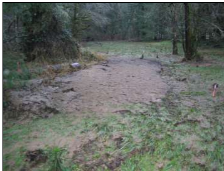
After the project: The large wood has increased overbank flows during flood stage.

Riparian restoration included mowing and spot spraying of blackberry and English ivy. In addition, native trees and shrubs were planted in a 40 to 100-foot band along the creek. Species planted at the site included western red cedar, Douglas fir, grand fir, ponderosa pine, salmonberry, elderberry, and Pacific ninebark.