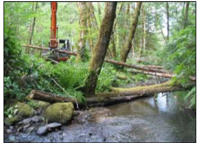
Implementation: An excavator was used to place large wood at 5 sites along Ferguson Creek.

Lack of large pieces of instream wood is a significant limiting factor for cutthroat trout on most streams in the Long Tom Watershed, as is insufficient number, size and density of riparian trees. This has led to decreased channel complexity, loss of pool habitat, and the scouring of gravel from streambeds.