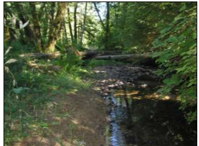
After the project: Three years later a variety of well-sorted gravels & large wood has accumulated upstream of the placed wood.