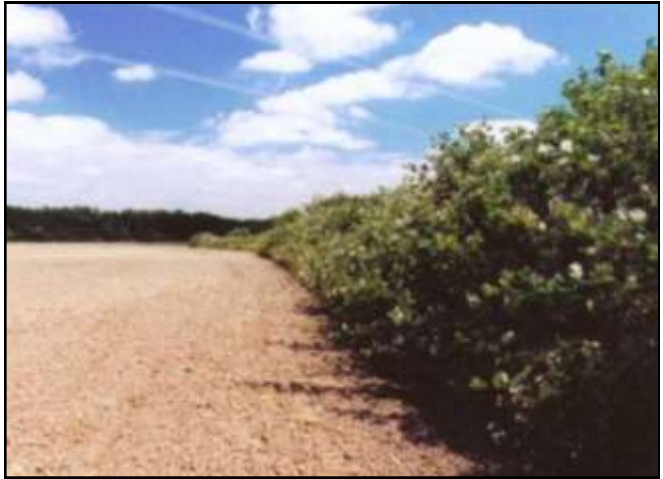
Pre-project (2001) : Blackberry dominated the riparian areas of the historic channel of Coyote Creek.

The current landowner began working with the Council and US Fish & Wildlife Service in 2001 to restore the property for fish and wildlife habitat. Segments of the historic channel had been isolated by previous agricultural activities and the native riparian vegetation had largely been replaced by invasive Himalayan blackberry. Also, the historic upland prairie had been converted into farmland.