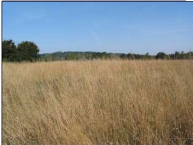
Restored native upland prairie benefits a host of native birds and butterflies.