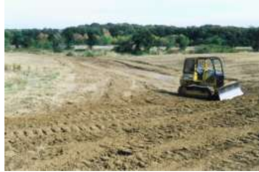
Bulldozer removes fill disconnecting historic Coyote Cr.