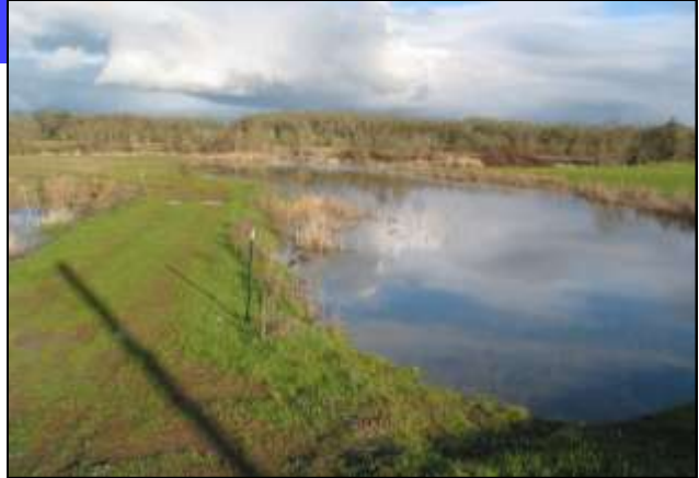
Hydrologic reconnection and prolonged summer water benefit native amphibians, turtles, and migrating waterfowl.