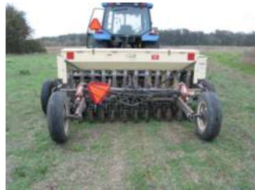
No till drilling native grasses to restore prairie.