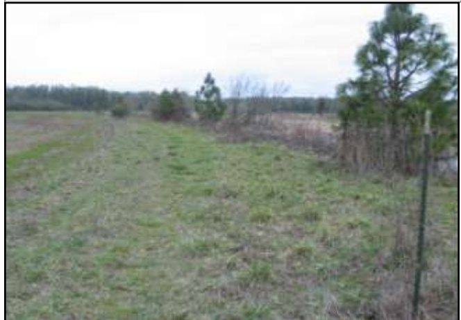
Nine years later (2010) : The blackberry has been eradicated and native trees and shrubs are establishing in the riparian zone.