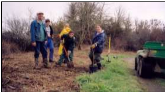
Scores of students and volunteers have helped plant riparian trees and shrubs.