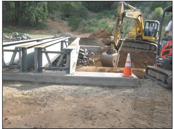
Bridge Construction: Support structure for bridge. Steel I-beams are connected to concrete footings set into the channel bank. Wood decking will be laid across the bridge. Rock rip rap is position at the base of the concrete footings.