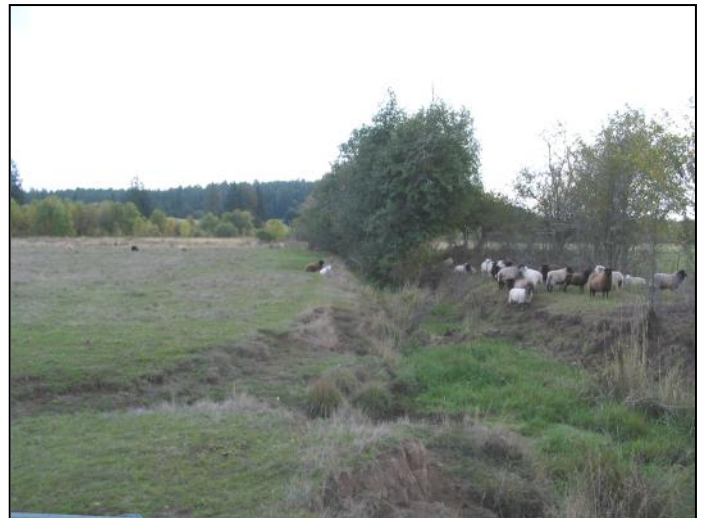
Before the project: Area of Turnbow Creek that will be fenced. Livestock currently have access to the stream. Note the narrow riparian area and lack of vegetation.

The Long Tom Watershed Council thanks our partners and funders!