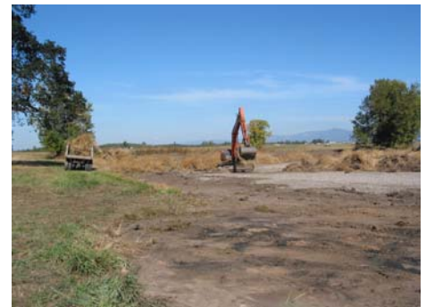
Excavator removing Reed canary-grass from marsh.

The project will enhance riparian zone conditions along the seasonal streams by removing Reed canary-grass and replacing it with native shrubs and grasses. These plantings will improve wildlife habitat within the fields and help filter out nutrients, sediment, and pesticides from the adjacent cropland. Reed canary-grass will also be removed from the marsh and replaced with native wetland vegetation, enhancing habitat for native amphibians and western pond turtle. Tom is also establishing a wildlife corridor between the forested wetland and the restored marsh by planting native trees and shrubs.