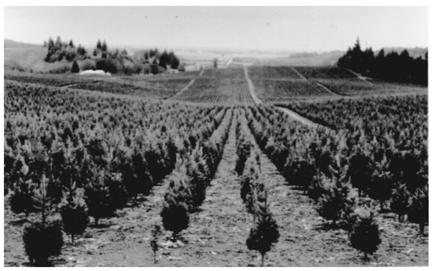
Figure 1. —Adequate weed control practices provide conditions for vigorous growth of quality trees.

Canada thistle, wild blackberries, and poison oak infest plantations.