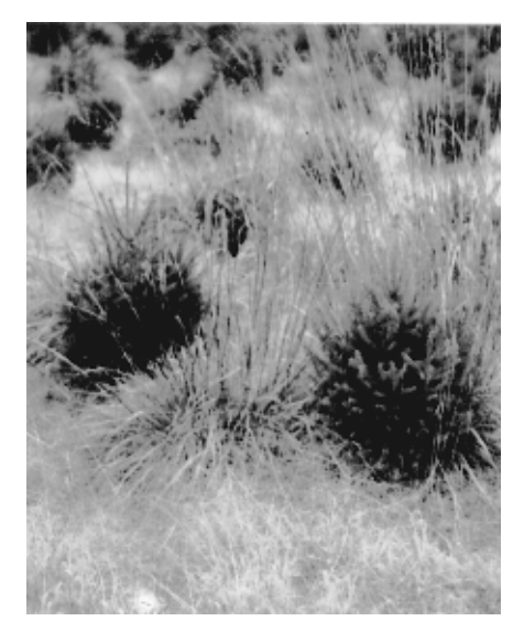
Figure 2. —Weeds reduce tree growth and quality by competing for water, nutrients, and (sometimes) light.