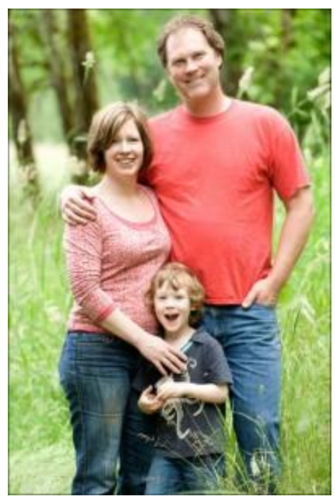
The Hagen family at their Confluence Farms home northwest of Junction City