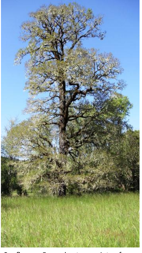
Confluence Farms hosts a variety of habitat types important to native fish & wildlife, including Oregon white oak.

LTWC's Annual Meeting will celebrate the commitment of landowners from the Ferguson Creek basin to improving habitat for fish, wildlife, and present and future generations. Ferguson Creek and its tributaries host a number of native plants, birds, and other wildlife. It's also one of the most important spawning and juvenile rearing habitat for areas for cutthroat trout in the watershed. The interest, cooperation, and dedication of Ferguson Creek residents has set a good example for the potential of other areas in the Long Tom watershed. We hope you'll join us September 21 for a country dinner and gathering of neighbors in a place that will have special meaning for generations to come.