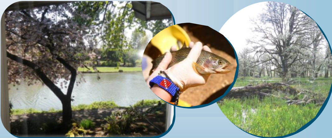
Enjoy beautiful views from Lewis & Clark’s dining room (left) and come learn about your local fish, wildlife and water quality.

If you only come to one meeting a year, this is it!