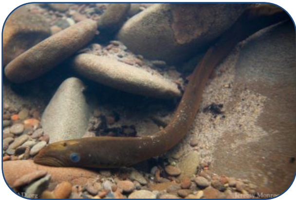
Pacific Lamprey