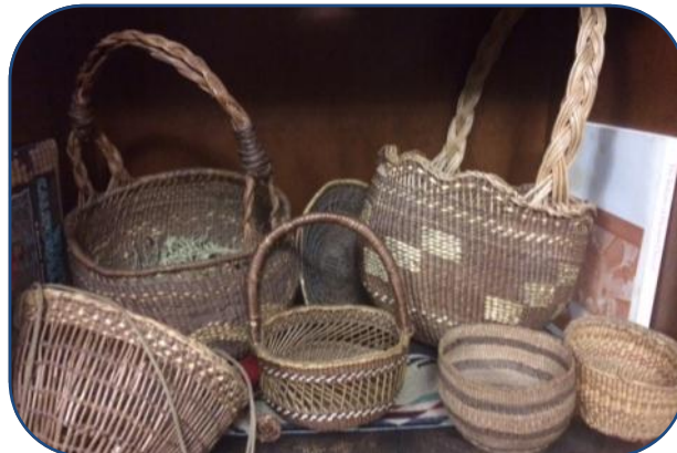
Traditional baskets