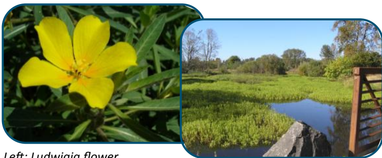
Left: Ludwigia flower

Tuesday, March 31, 6:00 p.m. Monroe Community Library (across the street from Monroe High School)