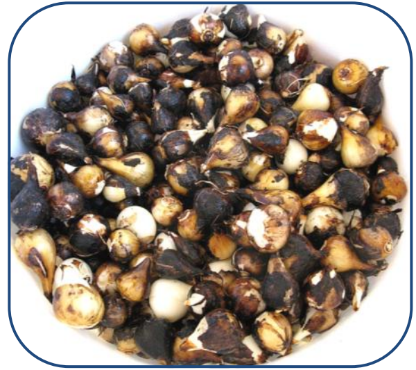
Camas bulbs are a traditional food source for local Indigenous people like the Kalapuya.

Folks have often commented that they enjoy learning about the natural and cultural history of the watershed, and we hope you won't miss this fun, engaging, and educational event on January 27 th in Veneta!