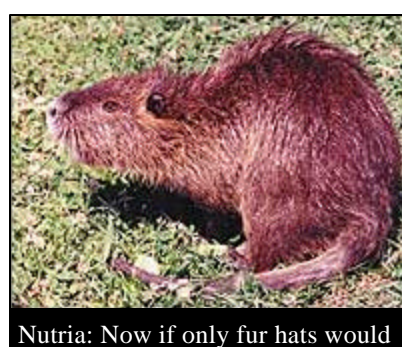
Nutria: Now if only fur hats would come back into vogue...

or millennia, mankind has transported other species of plants and animals around the world. Many were purposefully brought along to provide people with sources of food, fiber and shelter in their new homes, and have been thoughtfully managed and are staples of society and our culture. However, many other species have been stowaways in this long human journey, and created huge unintended impacts in these new environments. Some of the well-intentioned introductions have also exhibited tremendous competitive traits with native flora and fauna, colonizing and eventually dominating landscapes where they had not previously existed. Today we recognize these invasive species as a form of "biological pollution" which has very high consequences for our economy, our ecosystems, and our heritage. Cost to the US economy due