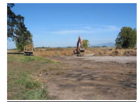
Excavator removing Reed canary-grass from marsh.

The project will enhance riparian zone conditions along the seasonal streams by removing Reed canary-grass and replacing it with native shrubs and grasses. These plantings will improve wildlife habitat within the fields and help filter out nutrients, sediment, and pesticides from the adjacent cropland. Reed canary-grass will also be removed from the