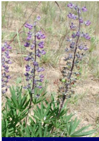
Kincaid's Lupine

The site's historic upland prairie and oak savanna habitats, which were common throughout most of the Willamette Valley prior to Euro-American settlement, have been altered significantly over the past 150 years. Both of these habitat types are increasingly rare in the Willamette Valley. According to a 1995 USGS report, Oregon white oak savanna habitat is among the 21 most endangered ecosystems in the U.S. Less than 1% of this