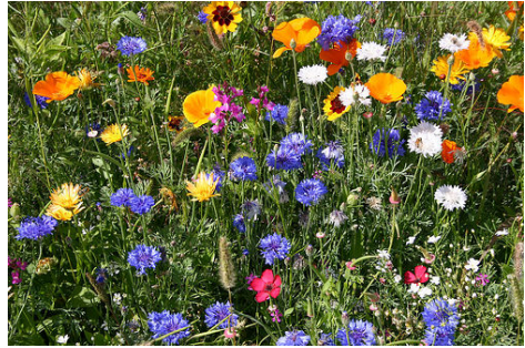
Wildflowers near Hood River

The seed packets have labels with romantic-sounding names such as meadow mixture and wedding wildflowers, while others tout backyard biodiversity and make reference to Earth Day. When growing 19 such packets of wildflower mixes, however, University of Washington researchers found that each contained from three to 13 invasive species and eight had seeds for plants considered noxious weeds in at least one U.S. state or Canadian province. And what makes it nearly impossible for gardeners who want to be conscientious is that a third of the packets listed no contents and a little more than another third had inaccurate lists. Only five of the 19 correctly itemized everything.