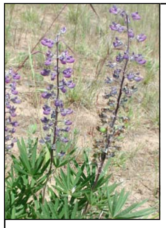
Kincaid's Lupine