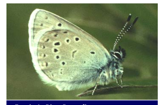
Fender's Blue Butterfly

Darin Stringer, Integrated Resource Management