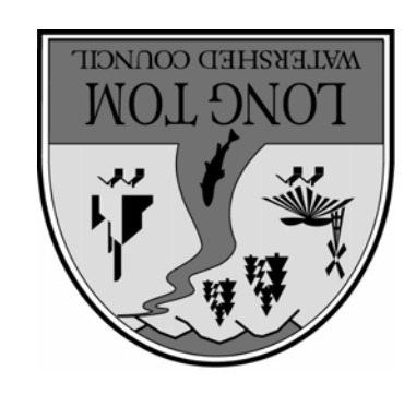
Long I om Watershed Council Phone: 683-6578 e-mail: coordinator at longtom.org www.longtom.org 751 S. Danebo Avenue