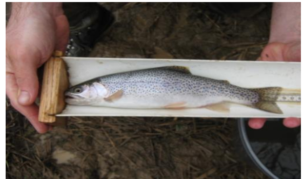
A cutthroat trout is measured as part of the watershed council's pilot fish tagging and tracking program.