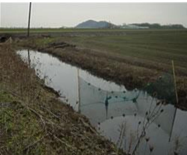
Sample reach within an agricultural ditch

Historically the upper Willamette River Valley, western Oregon, was characterized by seasonal floods and large expansions of its stream network. During the past century, human activities have altered or eliminated many intermittent stream and floodplain habitats in the valley. As a result, the remaining intermittent streams and ditches, referred to as watercourses, may still provide habitat critical for native fish. The objectives of this study were to determine: (a) fish presence; (b) spatial gradients of fish distribution (including species identity, native vs. non-native, and numbers); (c) fish