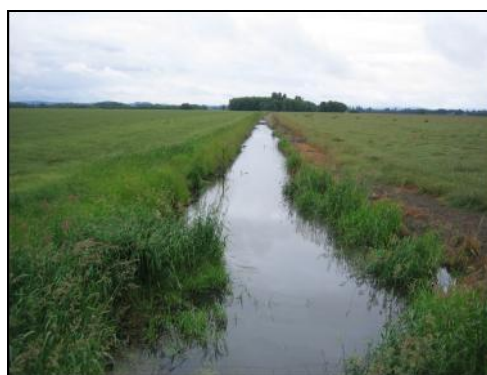
Before: The seasonal stream had relatively steep banks, making management difficult and increasing erosion. Reed canarygrass choked the stream.

On the first drainage, we hired Conser Quarry to slope the banks back approximately 3 to 1 with a small bulldozer, seeded the bare ground with native grass, and planted native shrubs every 50' – 100' to provide habitat for birds and other wildlife. We learned that this was not a shallow enough slope for easy mowing and that we should have waited to plant the native