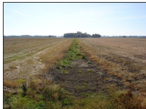
After: The more gradually sloped banks allow for easy management and lessened erosion. The native grass species in the drainage will filter out excess nutrients and pesticides.