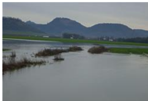
Flooded fields in December

use of the intermittent streams as spawning and nursery habitats; and (d) main factors that influence numbers of both fish and fish species. In winter and spring of 2002-2003, we examined the distributions of fish species in five sub-basins within the Willamette River Valley. Sampling sites were in intermittent watercourses that drained grass seed producing fields. We collected water samples and sampled fish December to May with minnow traps and an electrofishing unit, and collected standard fish habitat variables at all sites in spring. Thirteen fish species were found and only three of them were exotic. The presence of recently hatched and juvenile fish shows intermittent watercourses offer conditions suitable for spawning and juvenile rearing.