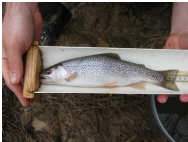
Cutthroat trout being measured

This study provided the foundation for a larger effort involving colleagues from various disciplines under a research project titled: Assessing Trade-Offs Between Crop Production and Ecological Services: The Calapooia Basin.