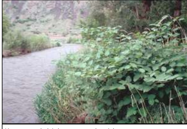
Knotweed thicket grows beside a stream on a riparian area.