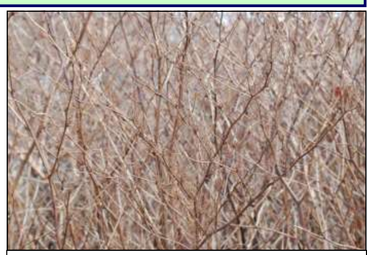
Winter knotweed: Dead, brittle, standing canes are what you will find this time of year.