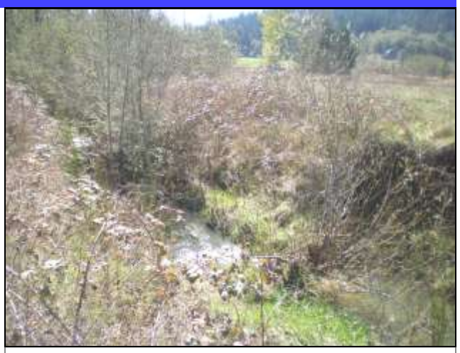
Before the project: This tributary to Spencer Creek lacked instream structural diversity such as pieces of large wood that create high quality habitat conditions for trout and their food (macroinvertebrates).