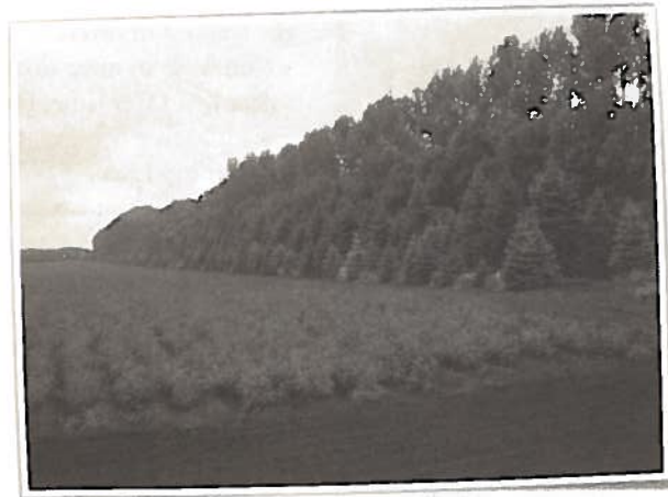
➦ Through species selection and design windbreaks can provide benefits for wildlife.