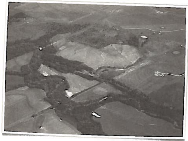
➦ Riparian forest buffers like the one pictured above support soil stability and water quality.