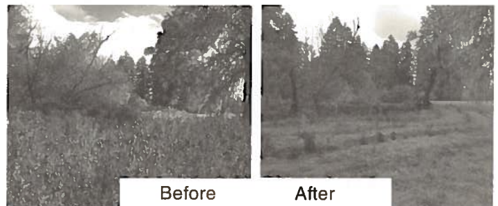
Before and after pictures of the riparian forest buffer installation at Confluence Farms.