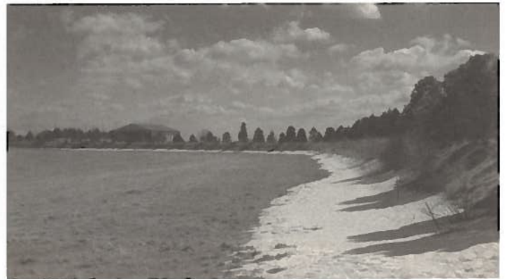
➤ Windbreaks also serve as a buffer between Rosmann's organic farmland and neighboring non-organic farmland.