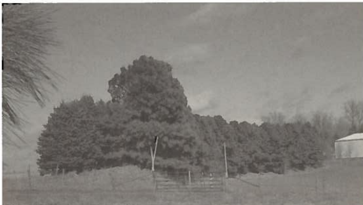
➤ Rosmann uses windbreaks to provide protection for livestock.