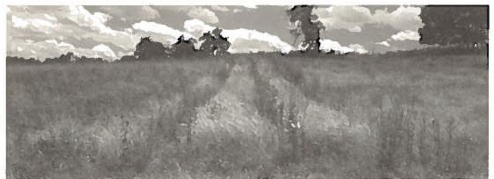
♣ Thistles in scalped tree rows.