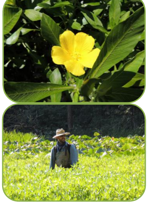
Top : Close up of Ludwigia flower and leaves. Bottom : Wading through a waterway infested with Ludwigia

the Narrow River Preservation Association before returning to Eugene to work for the City's Natural Areas Operations crew for nine years to work on oak and upland prairie habitat enhancement projects as well as trail design, construction and maintenance in the Ridgeline Trail System. His goal of restoring our native habitats, plants and animals, and legacy oaks align perfectly with those of LTWC. He grew up in New England, and he's lived in the Eugene area on and off since 1998. He and his family enjoy hiking, camping, reading, gardening and many types of sports.