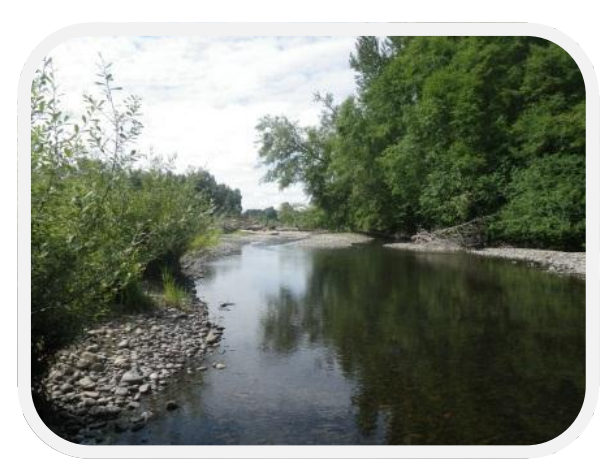
Invasive plants use waterways to spread seeds & plant parts to new areas. It's critical to identify & remove patches of noxious weeds before they spread & become firmly established.