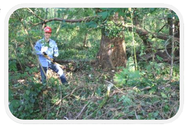
Involving youth in habitat stewardship. A Northwest Youth Corps member removes English ivy on private land near Christensen Landing State Park. Ivy & old man's beard form vines that can kill trees.

This project is also part of a broader opportunity to make connections with landowners along the Willamette. We have a long-term vision to work with property owners to develop ideas for fish and wildlife habitat improvement projects along this stretch of the Willamette. With over 15 years of helping landowners directly, we've become experts in helping people find solutions for fish, wildlife, and stream health that match their values. As part of the greater Willamette community, we're all in this together!