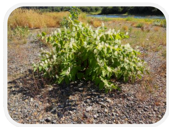
Knotweed on gravel bar along Willamette. This invader spreads aggressively from an extensive underground root-like network. It will form dense thickets that choke out native vegetation.

Identification : Knotweed is identifiable by its broad, heart-shaped leaves with pointy tips. The leaves grow alternately along the stems. In late summer and fall, knotweed forms plumes of usually creamcolored flowers. The leaves and stems die in winter, appearing as dead, brittle standing canes.