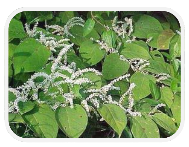
Close up of Japanese knotweed leaves and flowers. Note the broad, heart-shaped leaves with pointed tips and the clusters of whitish flowers.