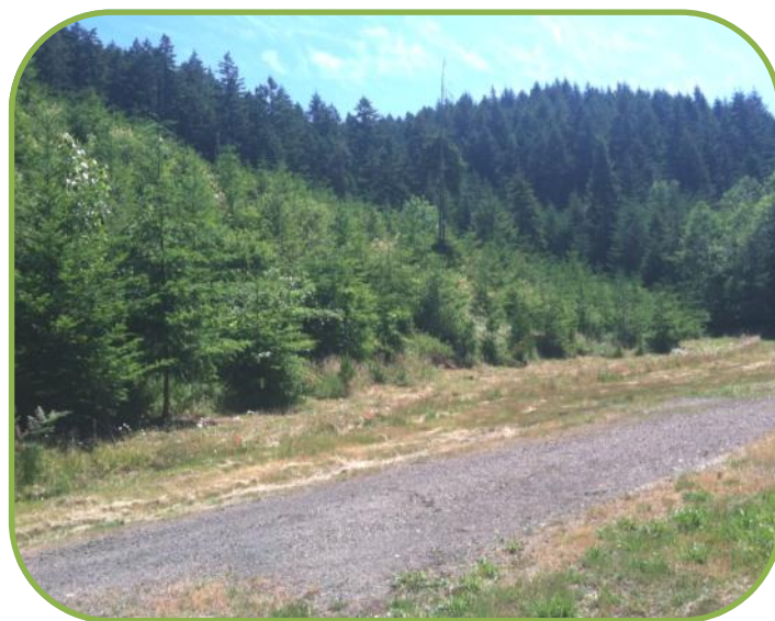
Photo of different aged stands of forest at Bauman Tree Farm. Cars can park along this road for the tour, and signs will be posted.

Bauman Tree Farm is about 30 minutes from central Eugene and 15 minutes from Veneta. Situated in the rolling hills of the Coyote Creek area, it is definitely worth the drive! We hope you'll join us on July 29 th 5:45 pm for this exciting opportunity! (tour leaves 6pm sharp).