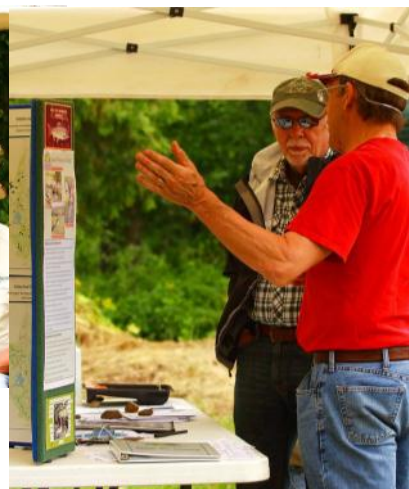
Educating the community about our vibrant watershed and LTWC's important work at the Living River Celebration June 28