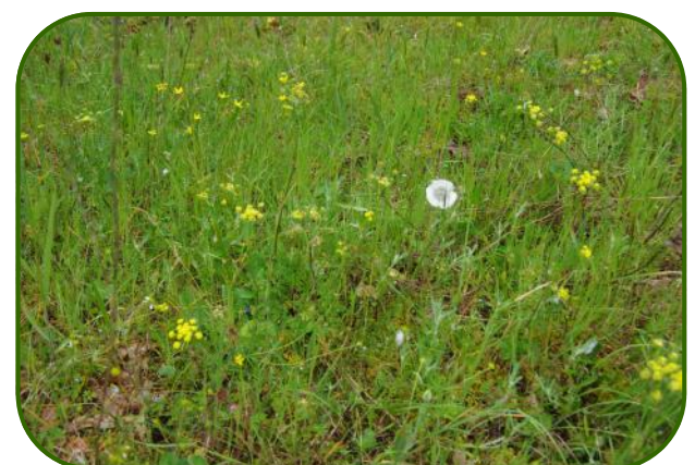
Photos : After thinning, legacy oaks ( top ) have the space to spread their crowns, which provides more acorns for wildlife, and more light is able to get through and stimulate the growth of wildflowers ( below ).

Much of the remaining high-quality prairie and oak habitat in the Long Tom Watershed is on private pasture lands. We encourage folks to call if they're interested in learning more about opportunities to improve