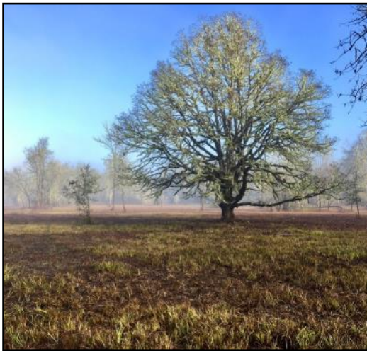
Beautiful fall views of oak and prairie

Outdoors off Hazel Dell Road, about one mile southwest of Eugene (address provided with registration confirmation)