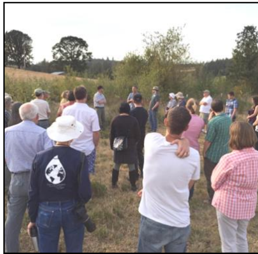
Outdoor Tour & Great Company!