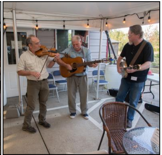
Live Folk Music!

Don't miss our biggest event of the year!