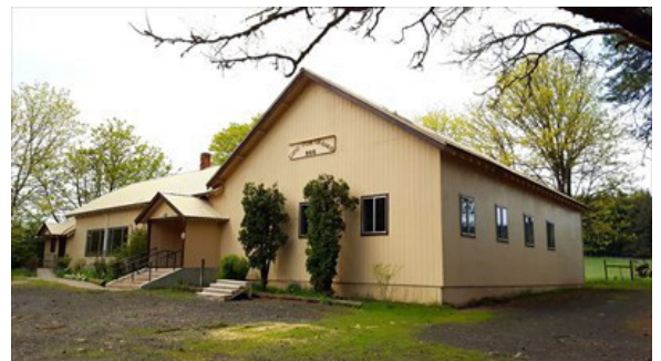
Long Tom Grange

We ask, but don't require you to register. Pre - Registration helps us to make sure we have adequate food and have you all pre-registered to speed the on site entry. Register by going to longtom.org/leap and complete the form. If you aren't able to attend, but want to support the LTWC, you can still go to the registration page and make a donation.