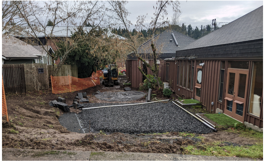
Construction of permeable paver patio, stormwater channel and the new Labyrinth.

Managing all on-site stormwater, as well as neighboring alley surface flow. Reducing groundwater load on the Friends Meeting House and downhill neighbor's foundations and crawl spaces