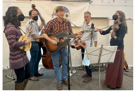
Meadow Rue Band